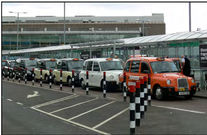
Edinburgh Airport taxi rank