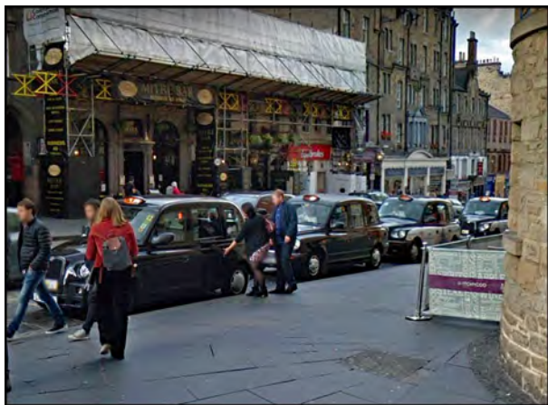
Royal Mile Radisson Hotel taxi rank

https://www.edinburghnews.scotsman.com/news/transport/readers-have-their-say-about-capital-s-taxis-1-4538616