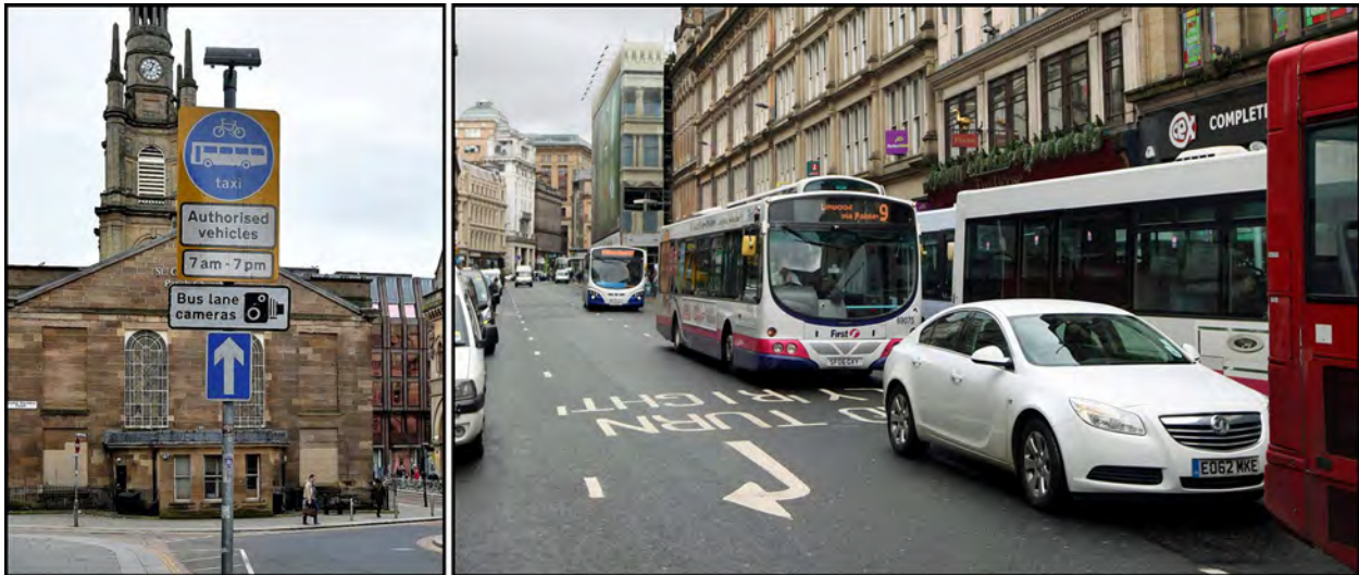
Segments, enhanced.

Below are a few other factors that should help dissuade you from driving within Glasgow City Centre and the West End.