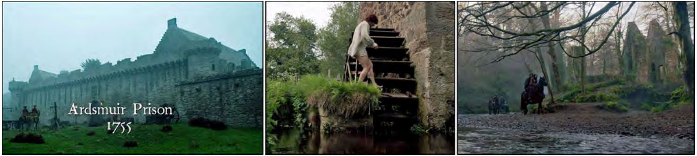
Craigmillar Castle (Site #48) Preston Mill (Site # 51) Roslin Glen Ruins (Site #53)

[See also: Prestonpans Battlefield (Site #49), Gosford House (Site #50), Glencorse Old Kirk (Site #52)]