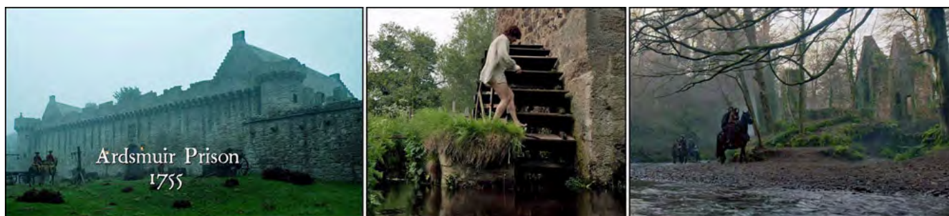
Craigmillar Castle (Site #48) Preston Mill (Site # 51) Roslin Glen Ruins (Site #53)

[See also: Prestonpans Battlefield (Site #49), Gosford House (Site #50), Glencorse Old Kirk (Site #52)]