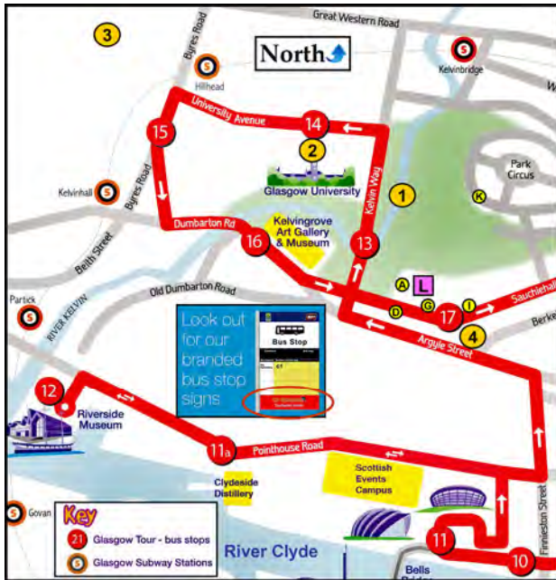
Glasgow West End Tour (Site #59)

The yellow-circled locations are the five Outlandish places discussed in the Glasgow City Centre Tour (Site #58) chapter. The orange-circled locations are the four Outlander film sites visited when following the Glasgow West End Tour (Site #59). In the list of bus stop names, we color-coded the stops associated with our tour sites.