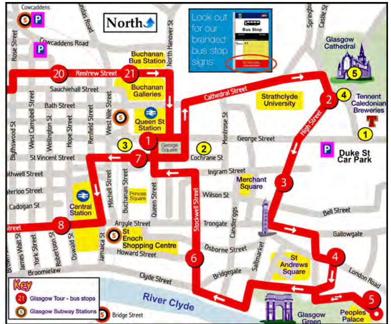
Glasgow City Centre Tour (Site #58)

[Images above are approximately 50% smaller than the images in the book.]