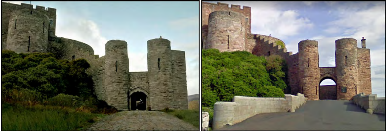
[ Outlander Season 1 screenshot (enhanced)] [Google Street View image segment (enhanced)]

The “hero” shot of Murtagh carrying Claire out of Wentworth Prison was filmed at Linlithgow Palace, then digitally inserted into CGI-enhanced footage filmed at Bamburgh Castle.