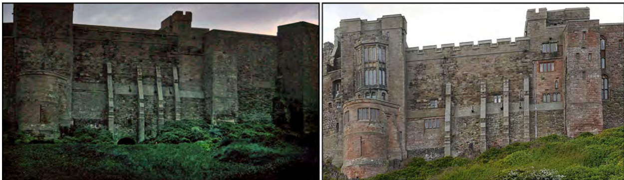
[ Outlander Season 1 screenshot (enhanced)]

Bamburgh Castle was used as a model for the CGI versions of Wentworth Prison's exterior. Above left is the prison as seen by Claire and her merry men when first approaching it in episode 115, "Wentworth Prison"—as well as at the beginning of episode 116, "To Ransom a Man's Soul," before they launched Jamie's rescue. Above right is Bamburgh Castle.