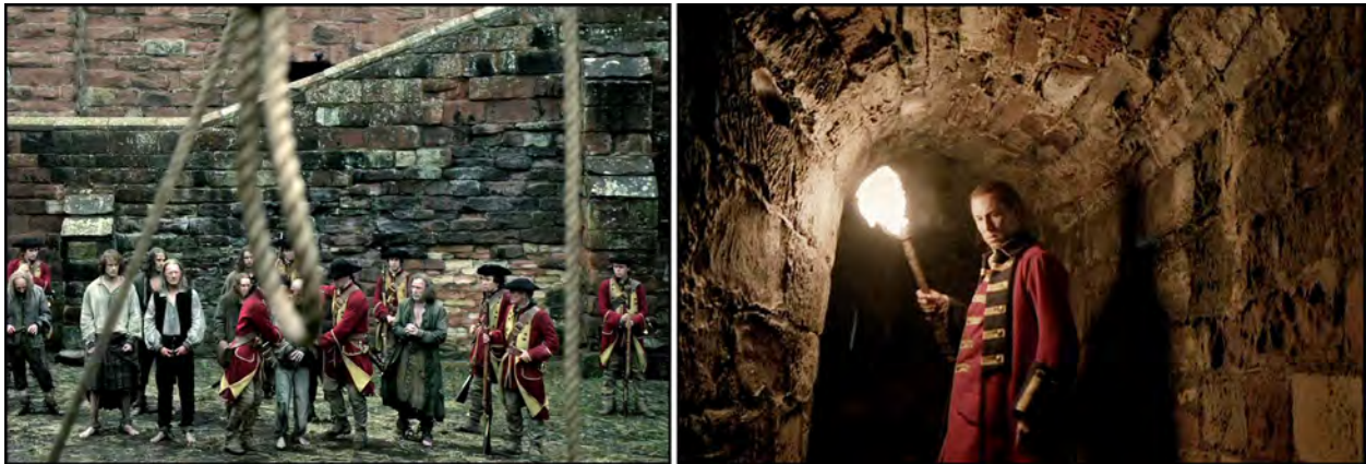
[ Outlander Season 1 screenshots (enhanced)]

As for Carlisle Castle (Site #65, in Outlandish Scotland Journey Part 7 ) and Linlithgow Palace (Site #34, in Part 4), many Internet resources report that all Wentworth Prison interior passageway scenes were filmed at Linlithgow Palace. That isn’t true.