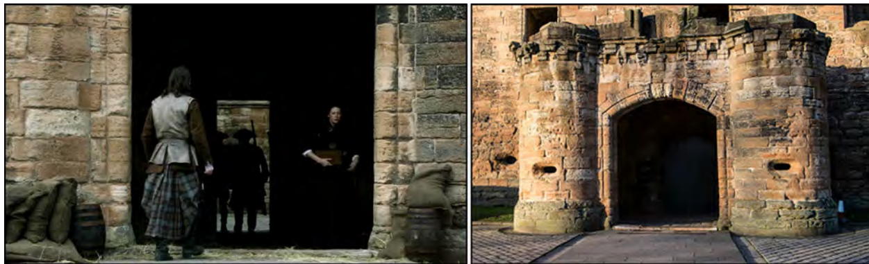
[Outlander Season 1 screenshot (enhanced)] [Internet-posted pic ©unknown segment (enhanced)]

Unless you’ll be driving to Scotland from England (such as from London), it simply isn’t convenient to visit Carlisle during a Scotland holiday. Happily, Linlithgow Palace—located between Stirling and Edinburgh—has at least two equally familiar Wentworth Prison film sites to offer.