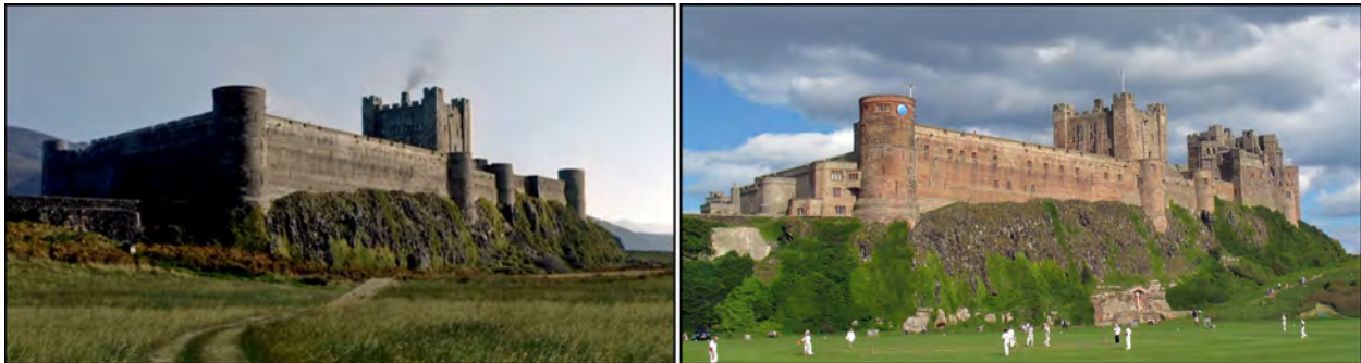
[ Outlander Season 1 screenshot segment (enhanced)]

Bamburgh Castle was used as a model for the CGI versions of Wentworth Prison's exterior. Above left is the prison as seen by Claire and her merry men when first approaching it in episode 115, "Wentworth Prison"—as well as at the beginning of episode 116, "To Ransom a Man's Soul," before they launched Jamie's rescue. Above right is Bamburgh Castle.