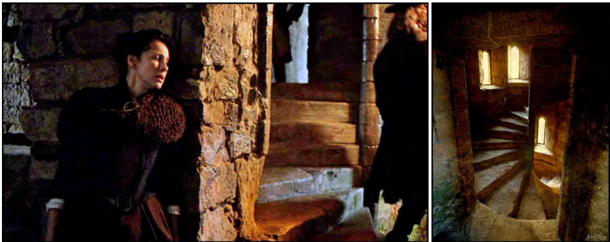
[ Outlander Season 1 screenshot (enhanced)]

The “hero” shot of Murtagh carrying Claire out of Wentworth Prison was filmed at Linlithgow Palace, then digitally inserted into CGI-enhanced footage filmed at Bamburgh Castle.