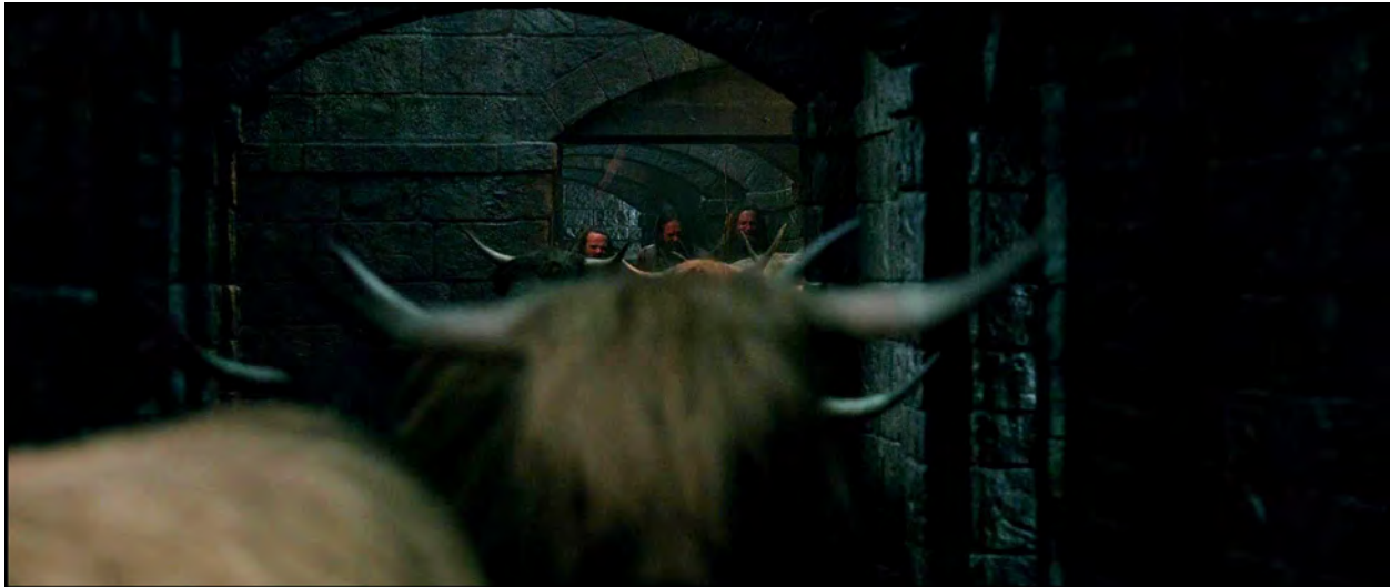
[ Outlander Season 1 screenshot segment (enhanced)]

Thanks to James' keen eye, we believe that these Wentworth Prison passageways are actually a set constructed at Wardpark Studios in Cumbernauld.