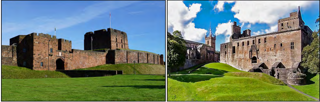
Carlisle Castle, above left. Linlithgow Palace, above right.

http://OutlandishScotland.com/NotGoingThere.pdf